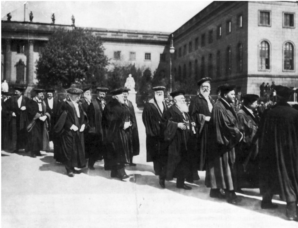
Schiller memorial day in Berlin, 1905 (Buddensieg et al. 1987, p. 222)