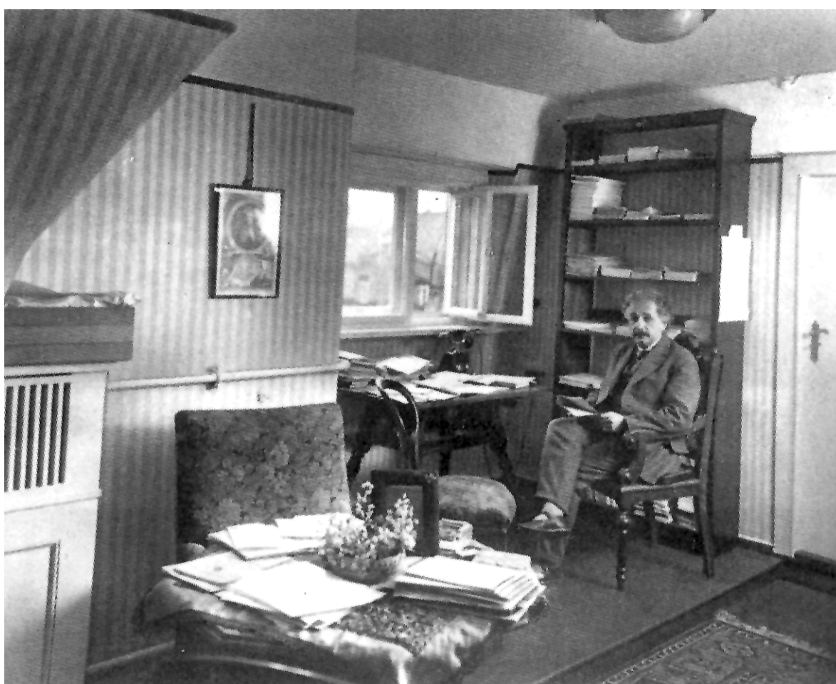
Einstein in his workroom, around 1930 (Grüning 1990, p. 136;)

on important and urgent problems in physics by gaining qualified researchers, and by giving them financial aid. The selection of problems, methods and laboratories is made by the undersigned members of the Direktorium. Nevertheless, suggestions reaching the Direktorium through other physicists could also be thought over and, in case of approval, the proposed projects will be funded. Despite the fact that, of course, the Institute will be fully effective only after the end of the war, the work should possibly be begun already now. Queries for detailed information should be addressed to the cosigner and chairman of the Direktorium, Professor Einstein (Haberlandstr. 5, Berlin-Schöneberg). The Direktorium. Einstein. Haber. Nernst. Rubens. Warburg." 13 Planck's name is missing, because Einstein forgot to place it. 14