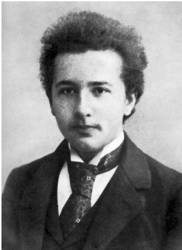
Einstein in Aarau, 1896 (Seelig 1954, p. 16)

What was the reason for Einstein generalizing his ideal of the true scientist to a universal concept of the individual which he turned against the dominant social and political values? The reason is to be seen in his critical distance to the society of the time. From childhood on, he felt alienated from the militarism and subservience of Wilhelmine Germany. His status as an outsider was also determined by the precarious economic and social status of his parents, whose electrotechnical business was always on the brink of failure. As the son in a liberal, Jewish family he belonged to a discriminated minority. Their efforts at assimilation caused significant internal conflicts of values for Einstein between the Jewish religion, enlightened liberal traditions, and an authoritarian pressure to conform. He found this conflict very disturbing, as his radical