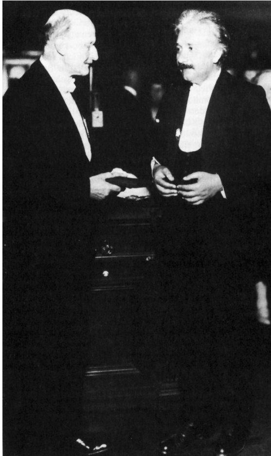
Max Planck and Albert Einstein, 1929 (Hermann 1979, p. 62;)

Einstein's further comments are also borrowed from the philosophers Schopenhauer and Spinoza. The scientist, as the artist, by observing and conceiving of the objective world, in its manifest reason and harmony, frees himself by overcoming his will, his passions and his urges. He elevates himself through his pursuit of the truth above "the shackles of selfish desire" 36 and experiences a pantheistic religious feeling. Einstein later described this religious experience as "cosmic religiosity," only to be experienced by "individuals of exceptional endowments, and exceptionally high-minded communities." 37 Einstein's ideas of an international republic of scholars 38 can be understood as such a community, held together by the necessity of international cooperation, common efforts to achieve greater insight, and an intellectual and emotional bond through 'cosmic religiosity'.