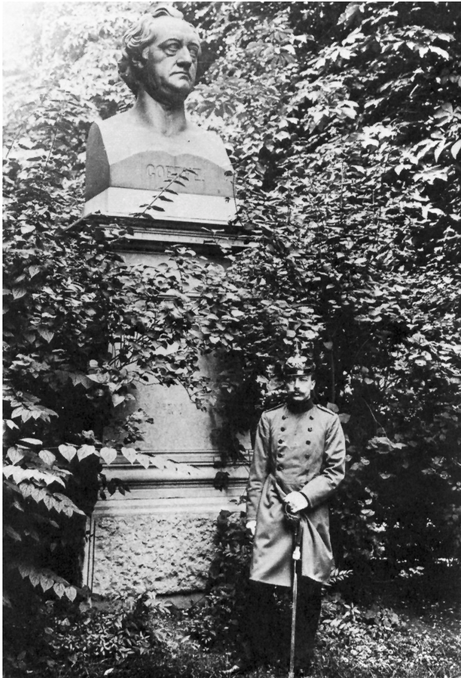
Max von Laue, 1904 (Hermann 1979, p. 46)

separated him from most colleagues, who shared his scientific ideals but fell back on the familiar social and political conceptions mostly of a nationalist, conservative order.